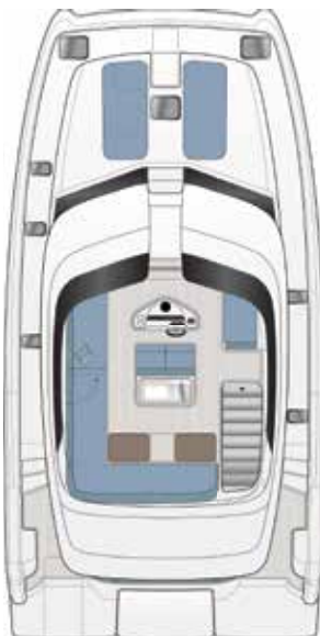
STANDARD 2 CABIN + UTILITY